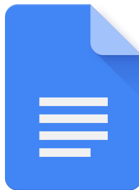
Google Docs (iOS)