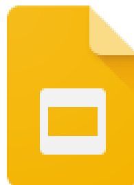
Google Slides (Android)